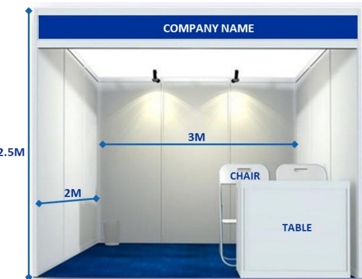
Exhibit Stall Dimensions

Facilities inside the stall : Each stall would be provided with :